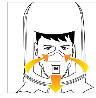
7 Breathe normally.

For 3M fit testing support tools visit 3M.co.uk/fittestrespirator